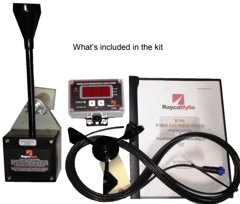
What's included in the kit